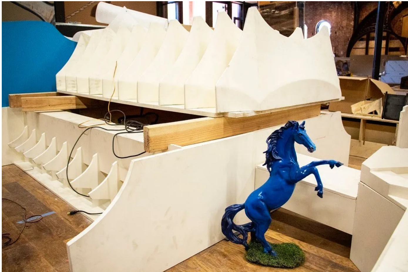
downtown Denver and the state capitol,