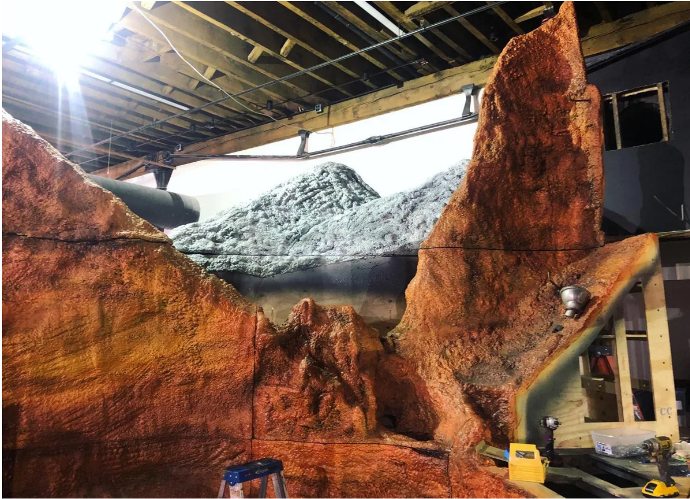
an amusement park hole that will look very familiar to Denver dwellers,